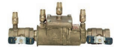
Typical DCVA installed at your meter (double-check valve backflow assembly)